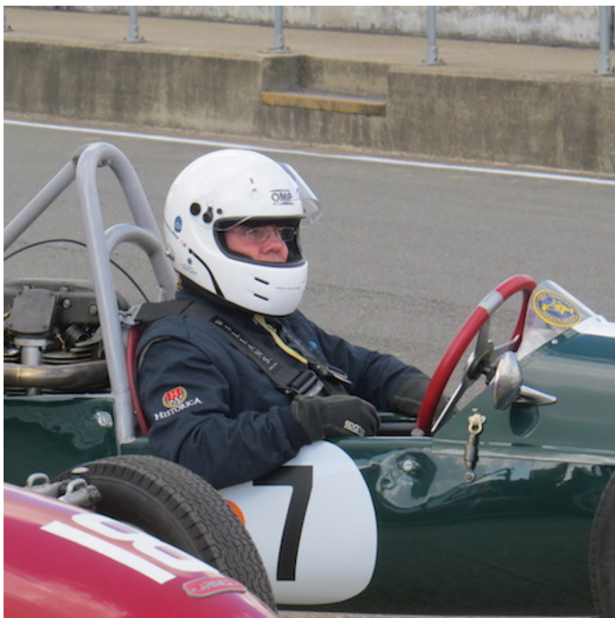
Relaxing at the start.