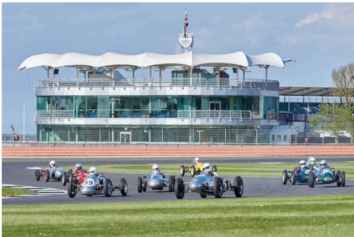
Darrell leads the pack.