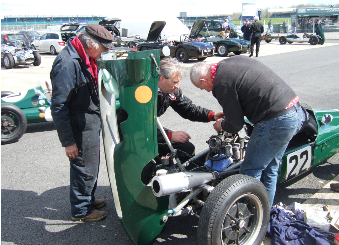
Frosty fixes the throttle slide.