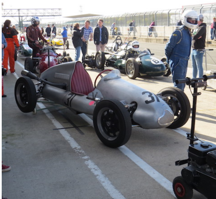
At the start.